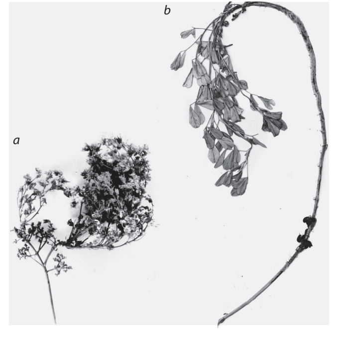
Fig. 6. Proliferation. a - in cauliflower inflorescence; <math>b - in long inflorescence.

some flowers had polymeric gynoecium, nevertheless most of the plants set the pods. In pea (Sinjushin, 2016) facsiation of the peduncle did not affected the viability of flowers in most cases, too. As a rule, fasciation affects most of SAM and FAM of the plant simultaneously, leading to the peduncles and stem flattening to the different extent. New combinations of mutant inflorescence types with fasciation and their designation are given in the Table 1.