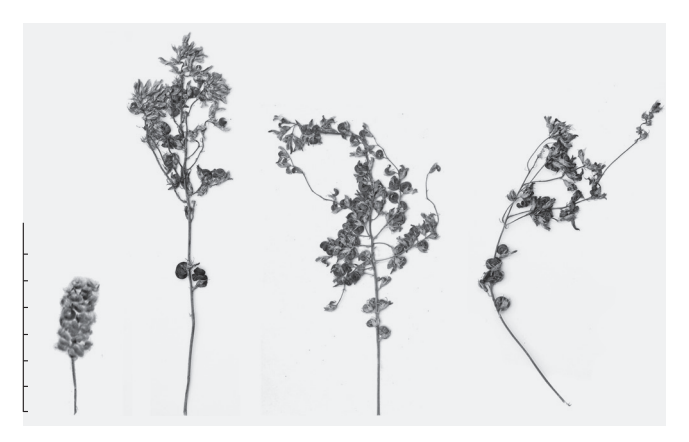
Fig. 3. Wild type (left) and branched inflorescences.

a – normal inflorescence of alfalfa – a raceme; b – fertile panicle with pods (pi-1); c – sterile panicle (cauliflower type inflorescence).