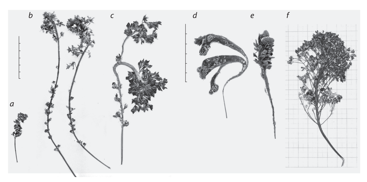
Fig. 5. Fasciated long petiole lpfas inflorescences and inflorescence of hybrid plants from hand crosses between different mutant types with fasciated long inflorescence.

a – maloasian alfalfa S1 plants from VIR collection selections; b – spontaneous mutants.