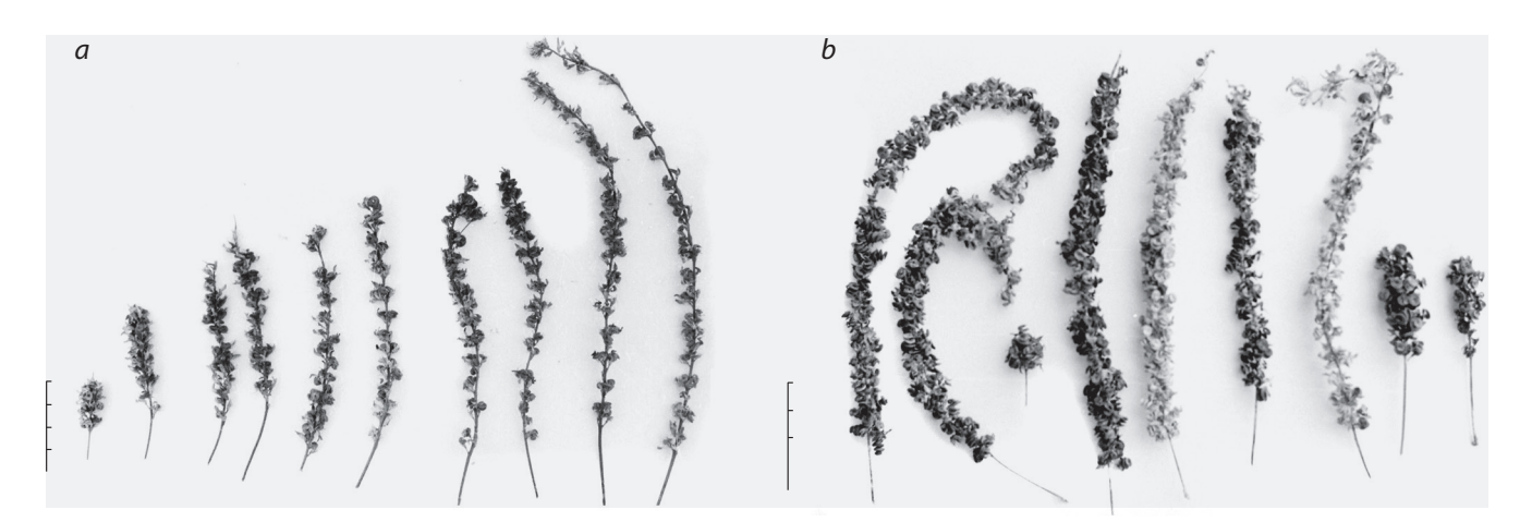
Fig. 4. Long inflorescences.

a – maloasian alfalfa S1 plants from VIR collection selections; b – spontaneous mutants.